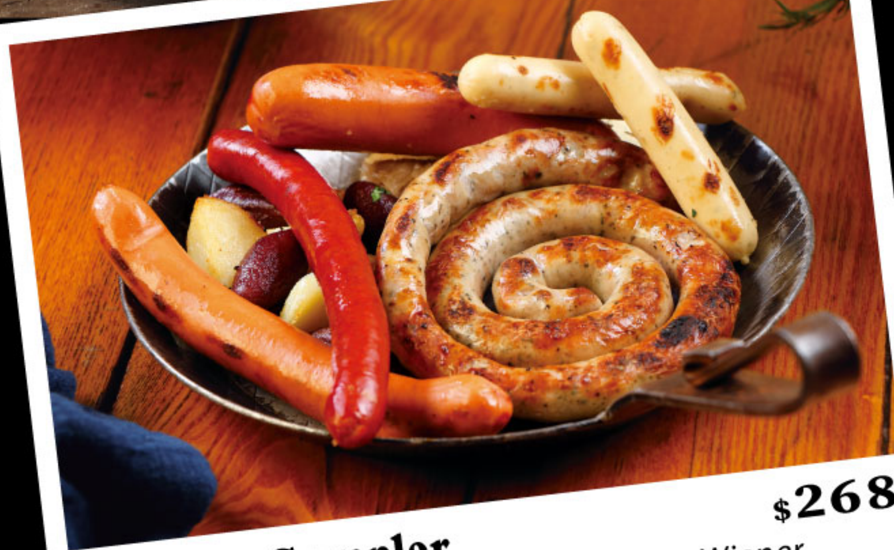
Sausage Sampler $268 (Nuremberg Snail, Kasekrainer Sausage, Wiener Sausage, Cervelat Sausage, Chipolata Sausage) 烤腸拼盤