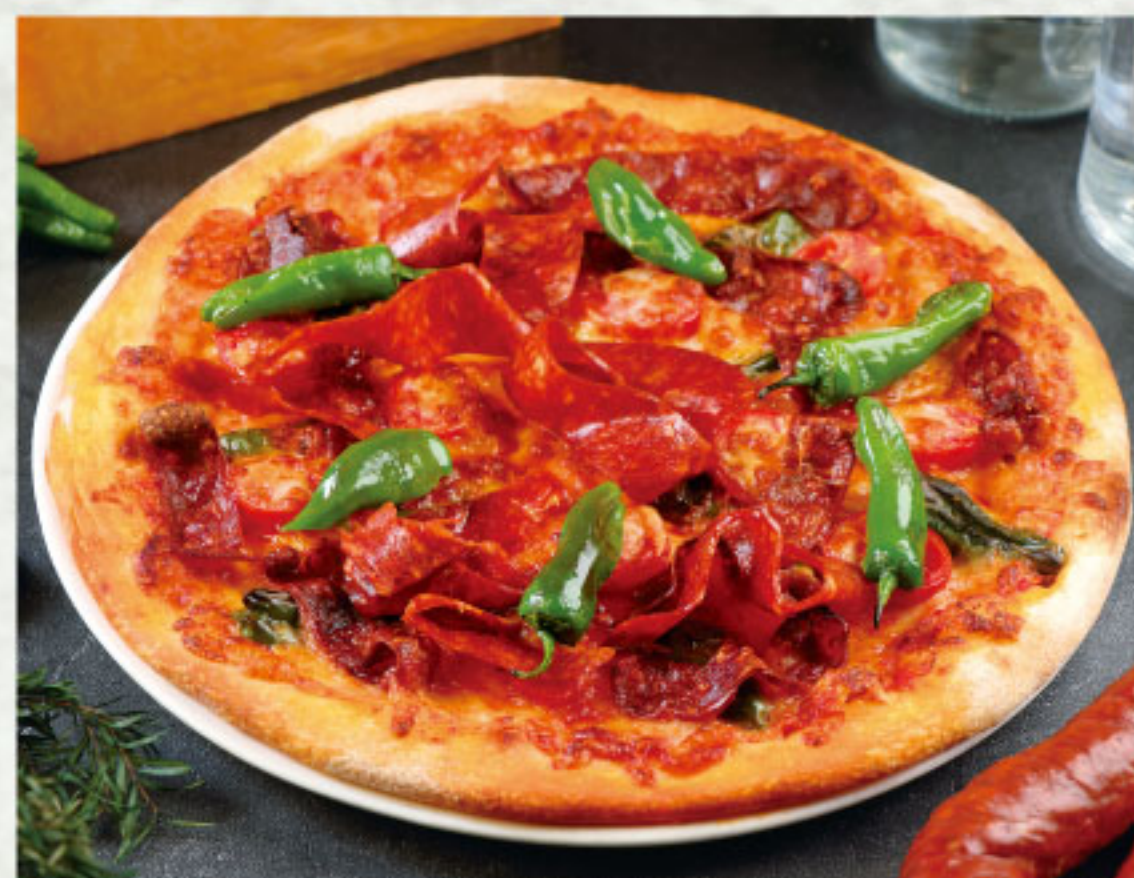
Spanish Chorizo, Padron Pepper Pizza 西班牙風腸, 青椒薄餅