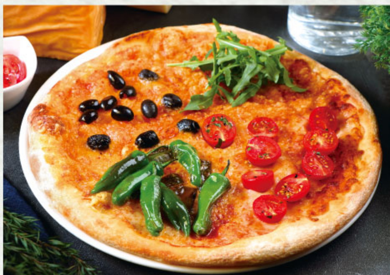
Four Cheese Pizza 四色芝士薄餅