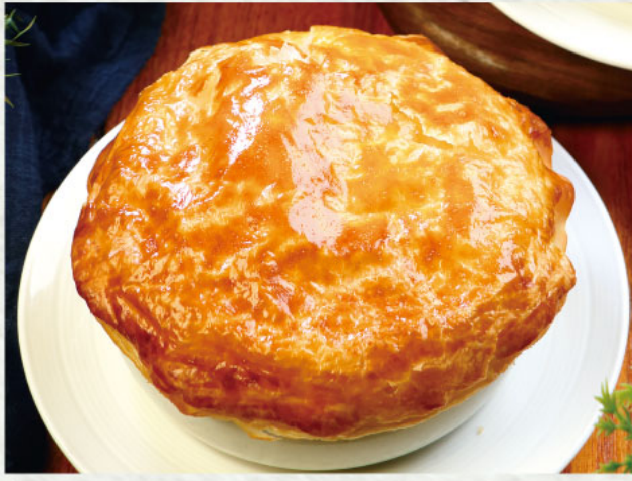
Seafood Chowder in Puff Pastry 酥皮海鮮周打湯