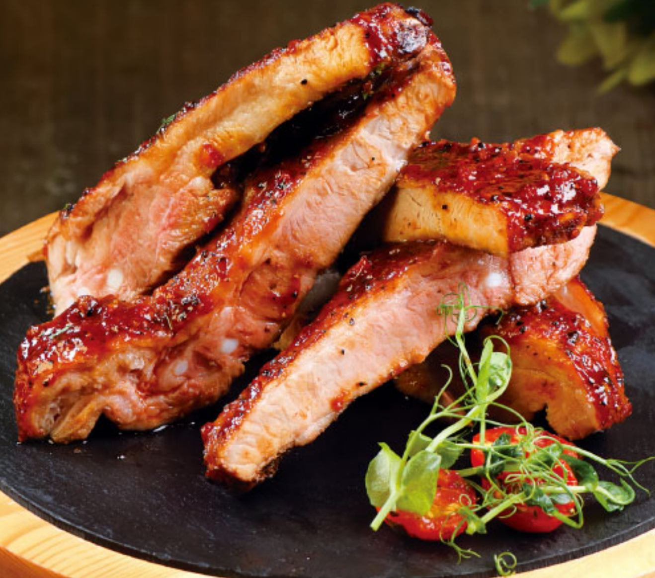
Roasted St. Louis Pork Spare Ribs $268 with BBQ Sauce 6pcs 聖路易斯豬肋骨, 燒烤醬 (6條)