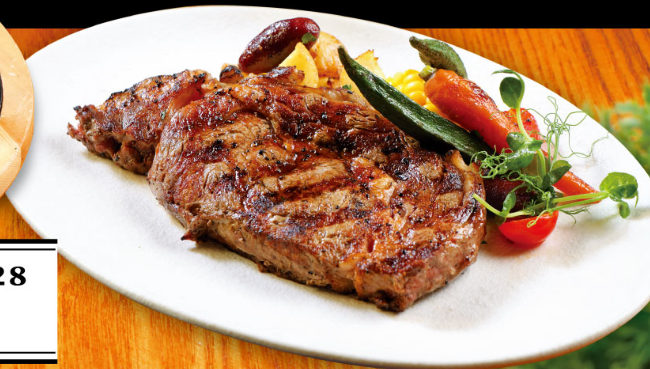
US Angus Ribeye 400g $428 美國安格斯肉眼扒