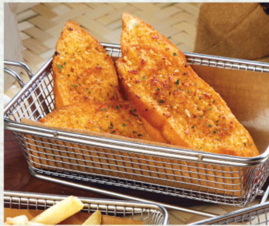
Garlic Bread 4 pcs $48 蒜茸包 (4件)