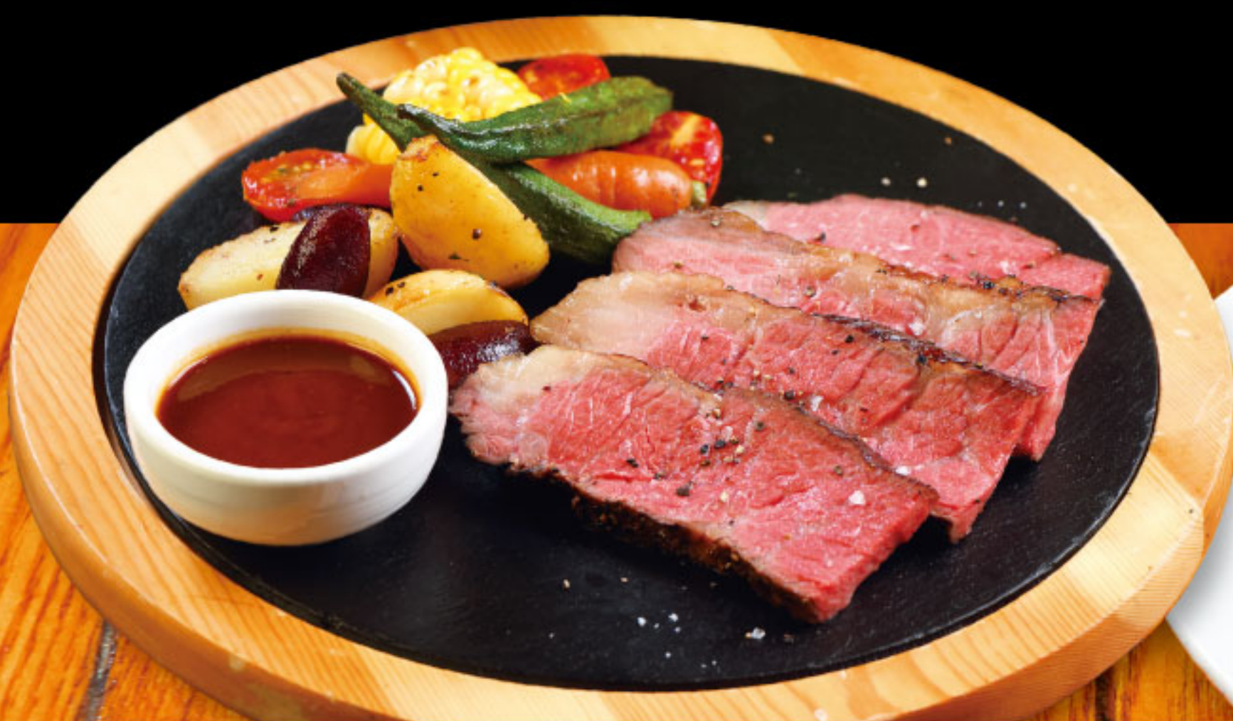
Low Temperature Roasted $328 Chuck Flap 低溫烤焗牛肩扒