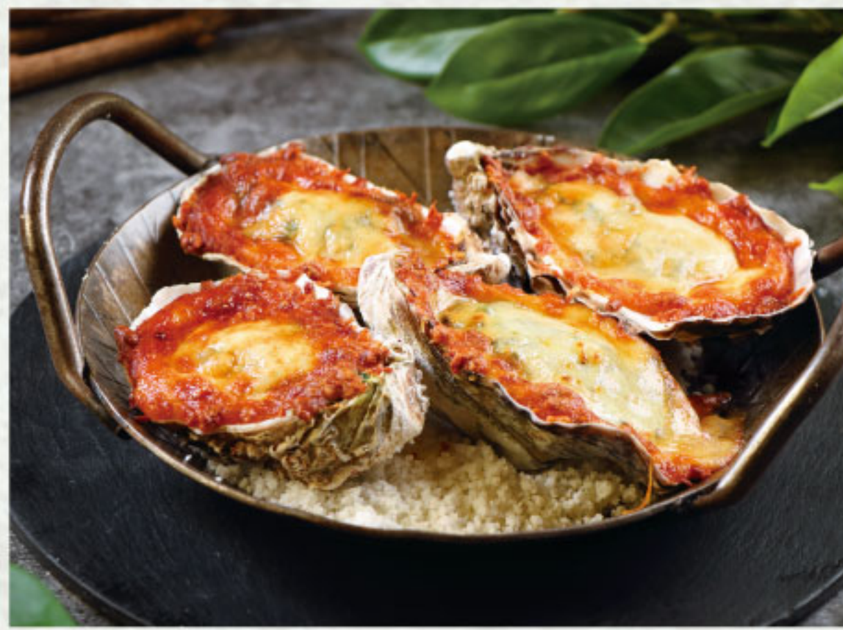
Baked Oysters with Bacon and Spinach And Cheese 4pcs $138 煙肉, 菠菜芝士焗蠔 (4件)