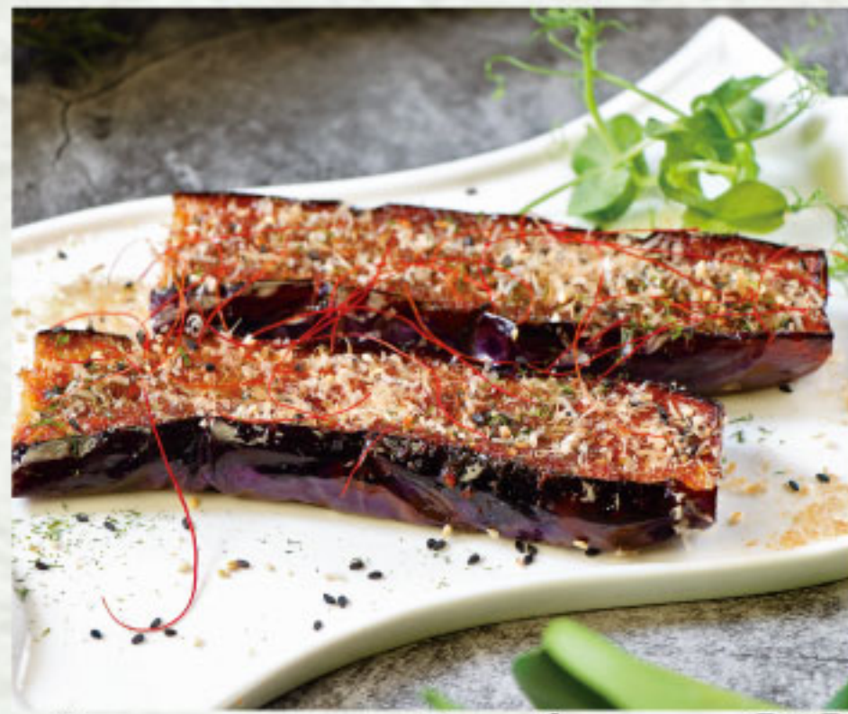
Japanese Styles Roasted Eggplant $88 日式燒茄子

Charocola Grill 炭燒小食 Charcoal Grilled skewers Platter $248 炭燒串燒拼盤 Chicken Wings, Beef, Chicken, Corn, Pineapple, Padron Pepper (雞翼, 牛肉, 雞肉, 粟米, 菠蘿, 西班牙青椒)