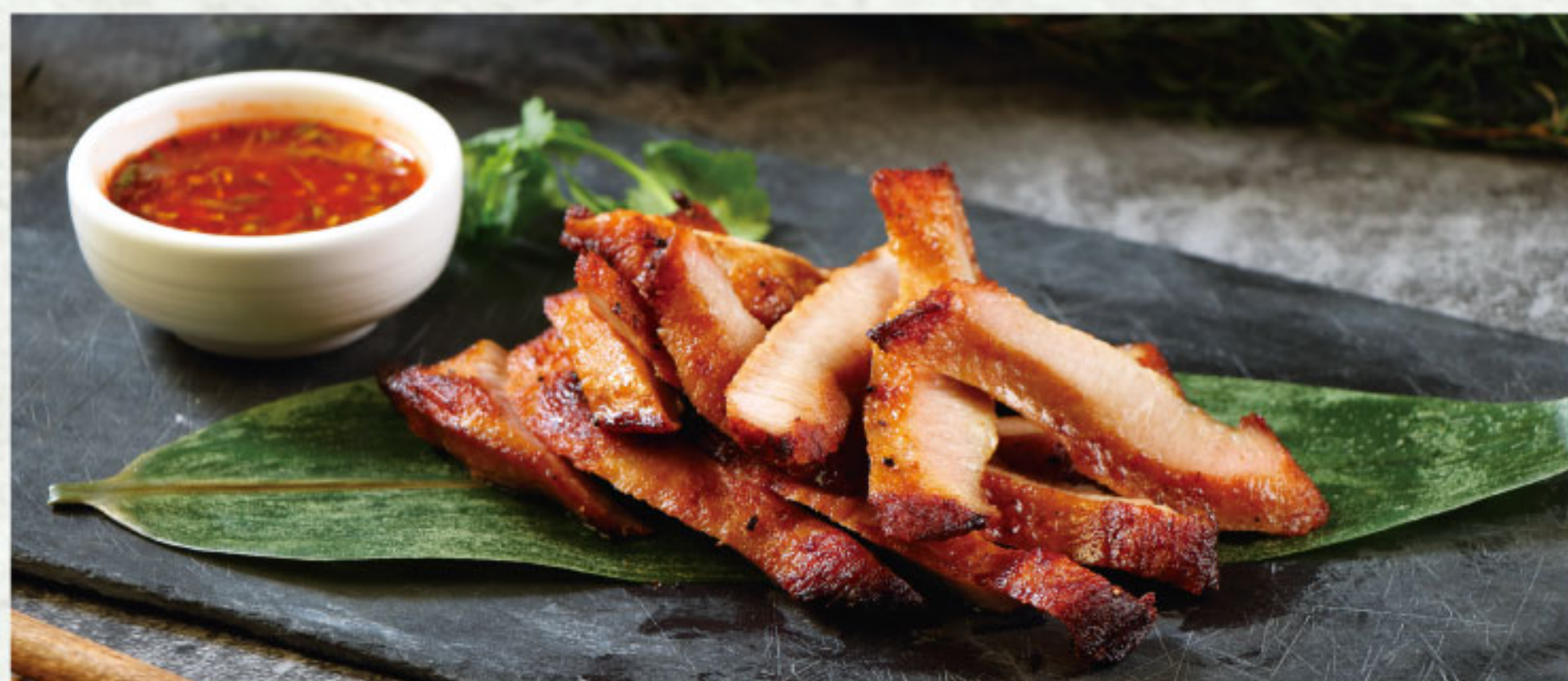
Grilled Pork Neck $108 燒豬頸肉