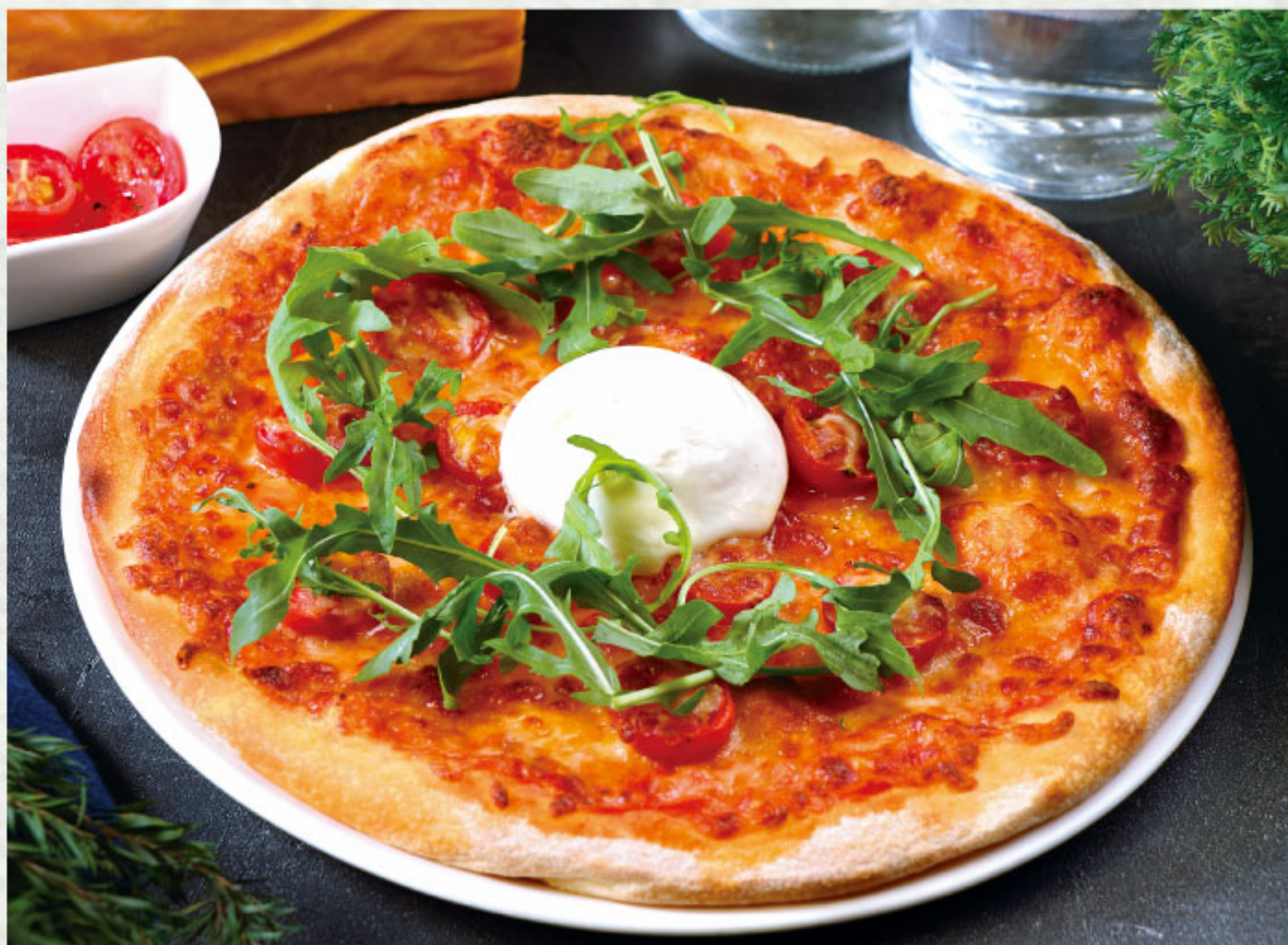
Margherita with Burrata Cheese 布袋芝士, 番茄香草薄餅