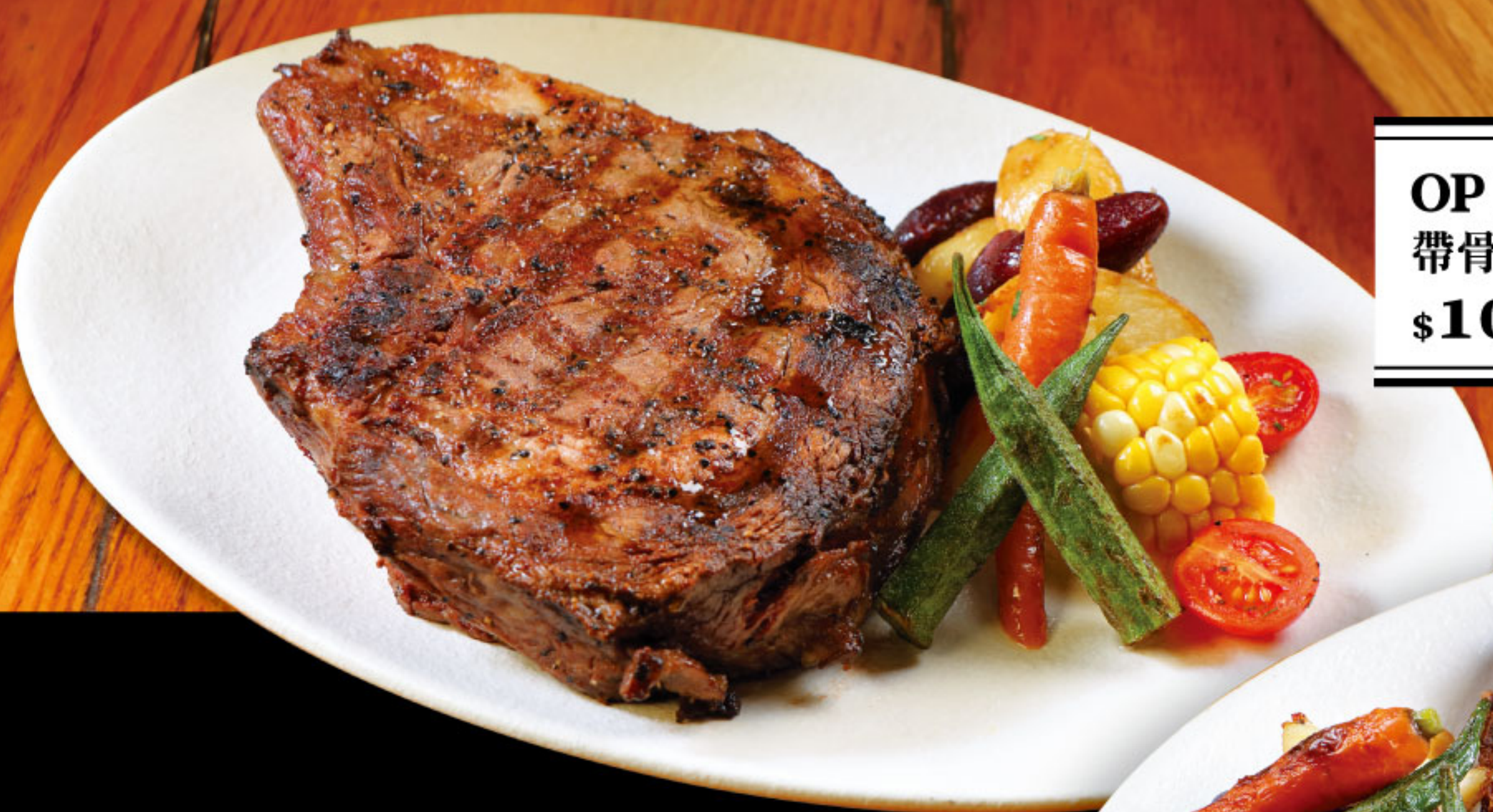
OP Rib 1.2kg 帶骨肉眼扒 $1088