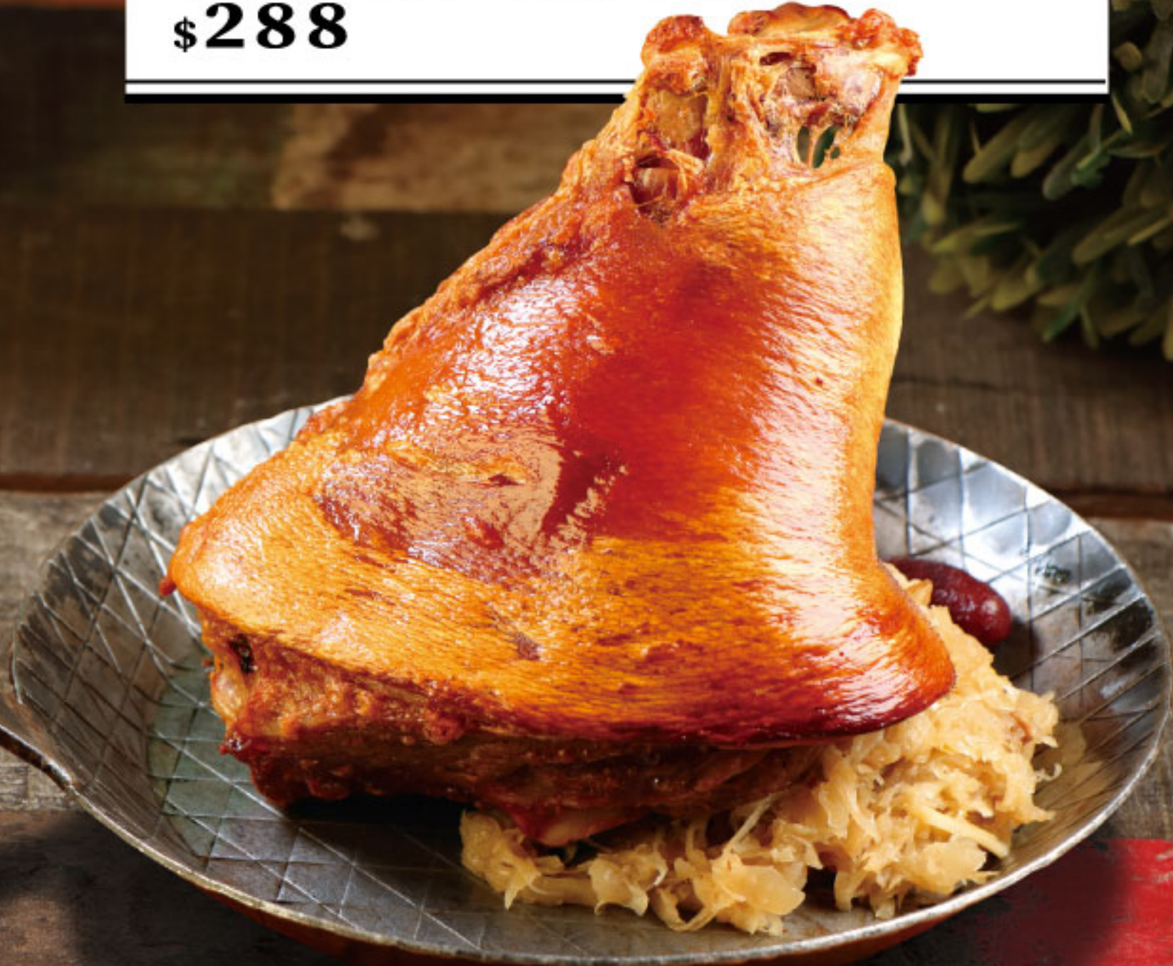
Crispy Roasted Pork Knuckle with Sauerkraut and Potatoes 脆皮德國豬手, 酸椰菜, 燒薯 $288