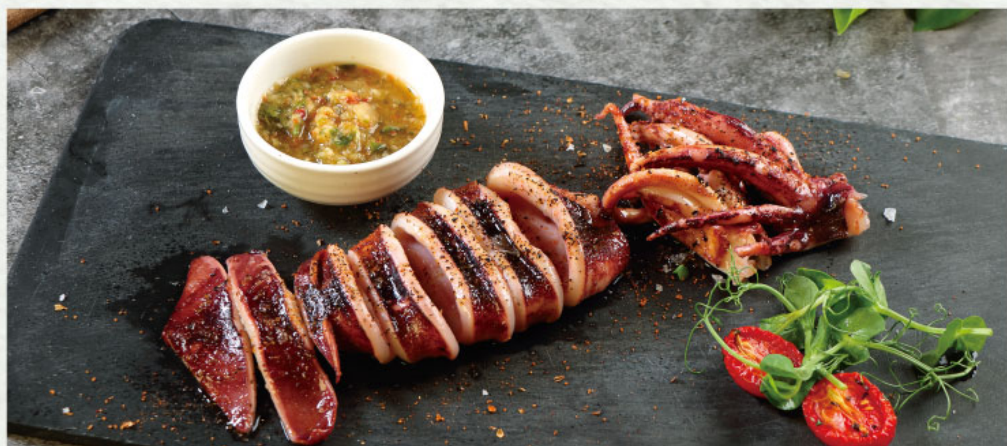
Grilled Squid $128 燒魷魚