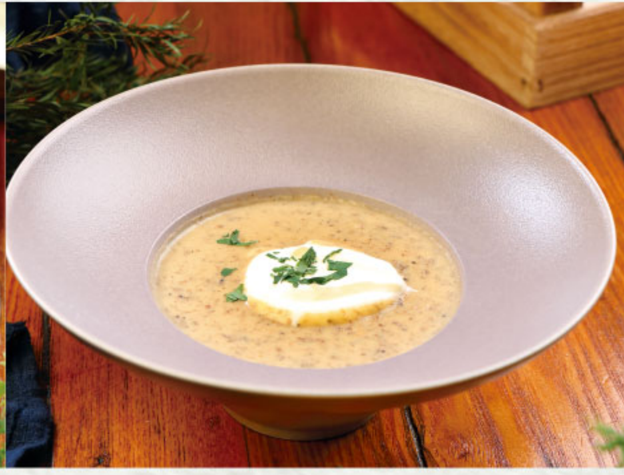
Cream of Wild Mushroom Soup 野菌忌廉湯