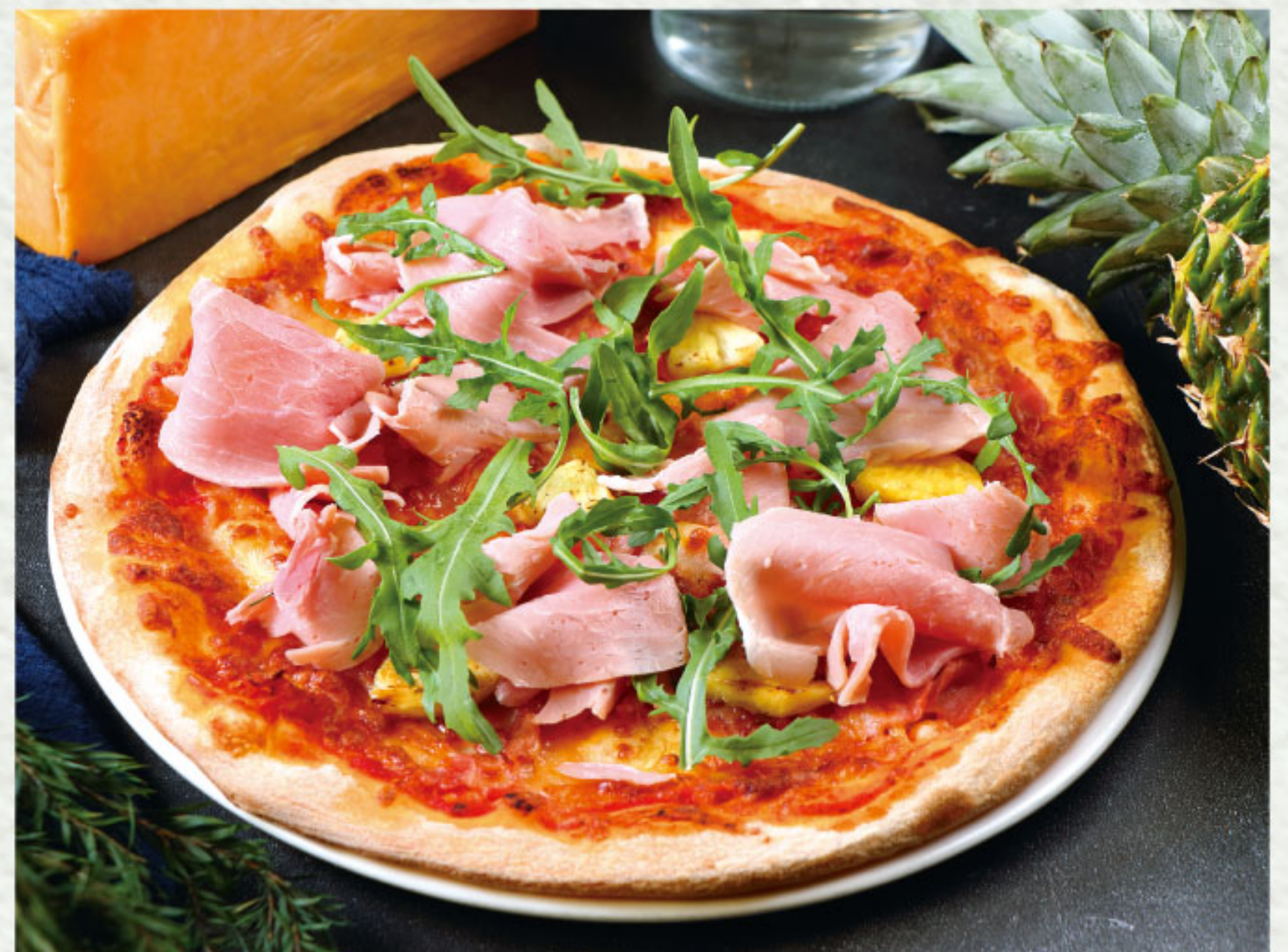
Hawaiian Pizza 菠蘿, 火腿薄餅