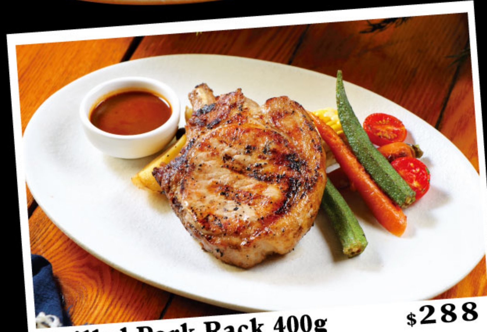
Grilled Pork Rack 400g $288 加拿大豬鞍扒