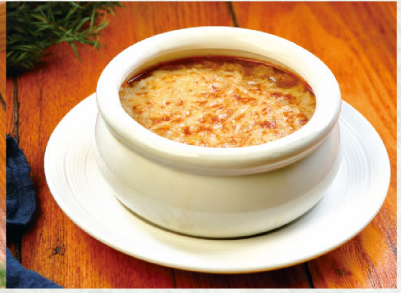
French Onion Soup 法式洋蔥湯