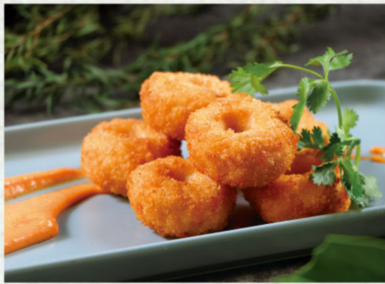
Thai Style Deep Fried Shrimp Cake with Chili Mayo $98 泰式炸蝦餅