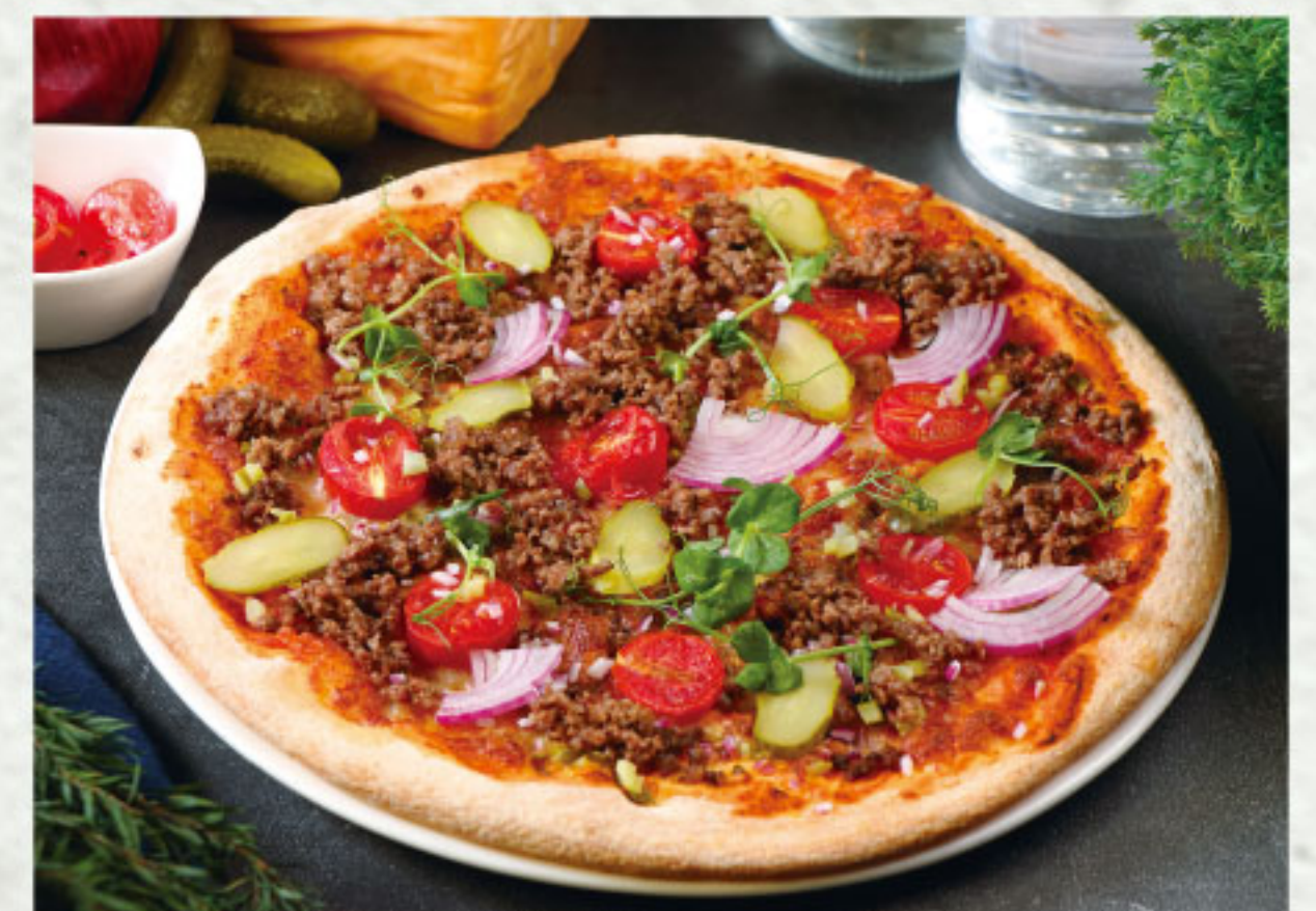
Double Cheese Burger Pizza 雙重芝士漢堡薄餅