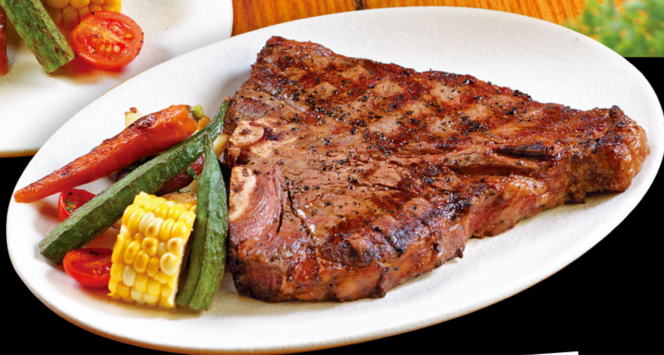
US Prime T Bone 900g $1088 美國頂級T骨扒