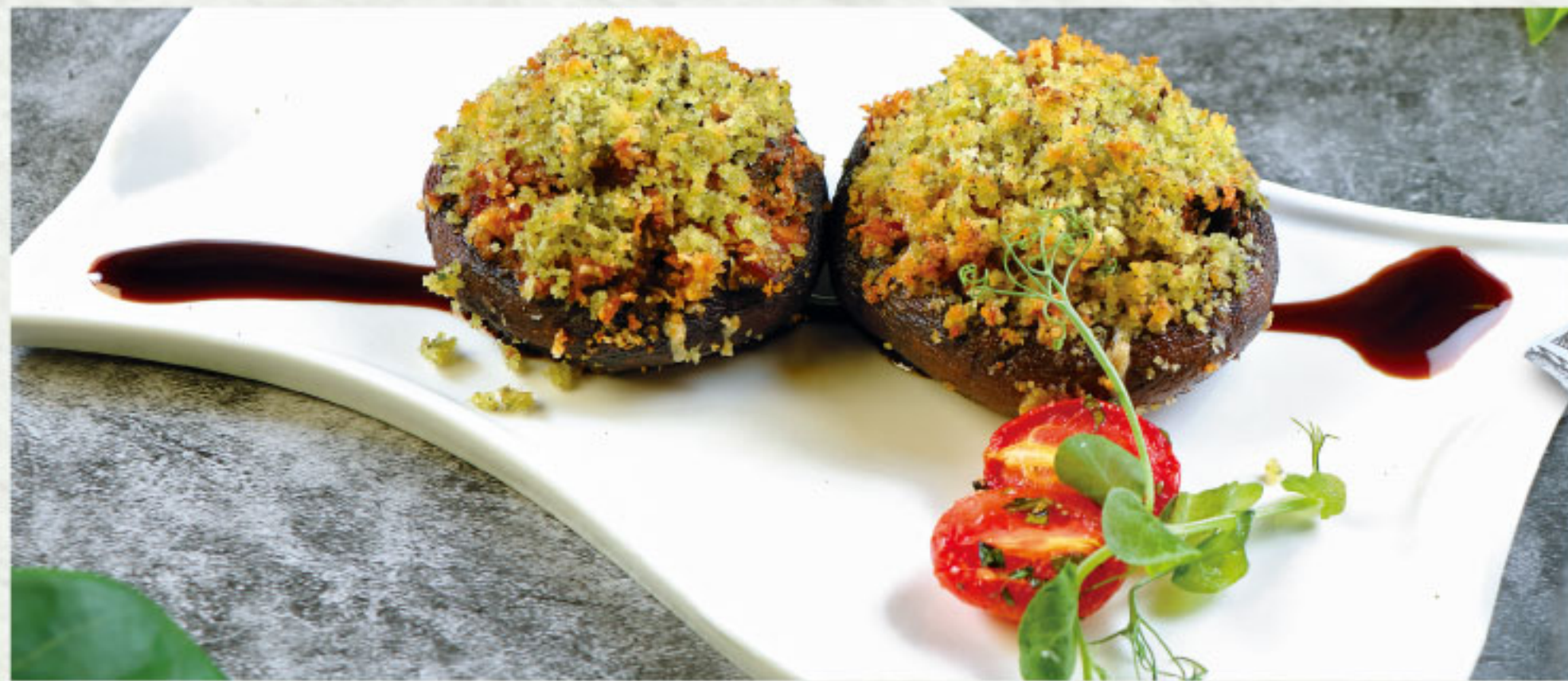
Baked Portobello Mushroom with Escargot, Herbs Bread Crust $138 脆香草包糠焗大啡菇釀田螺

Charocola Grill 炭燒小食 Charcoal Grilled skewers Platter $248 炭燒串燒拼盤 Chicken Wings, Beef, Chicken, Corn, Pineapple, Padron Pepper (雞翼, 牛肉, 雞肉, 粟米, 菠蘿, 西班牙青椒)