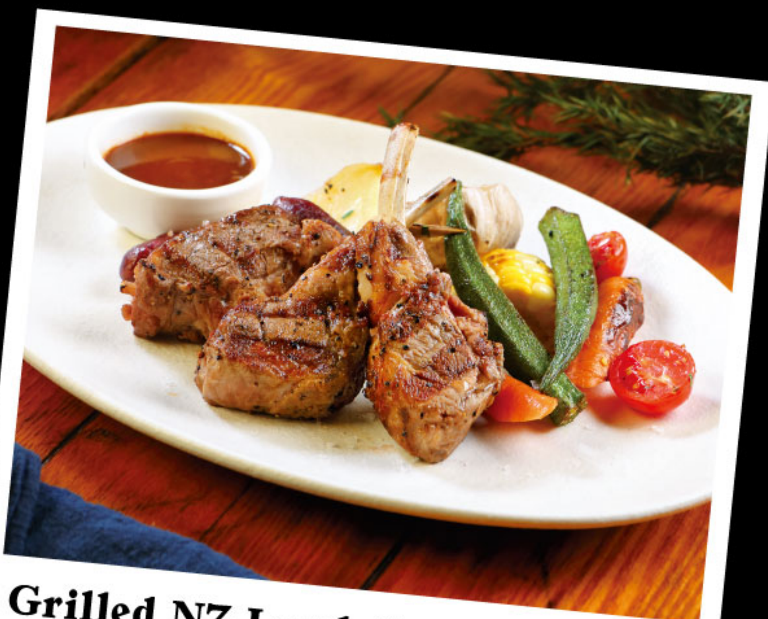
Grilled NZ Lamb Rack $388 紐西蘭羊扒