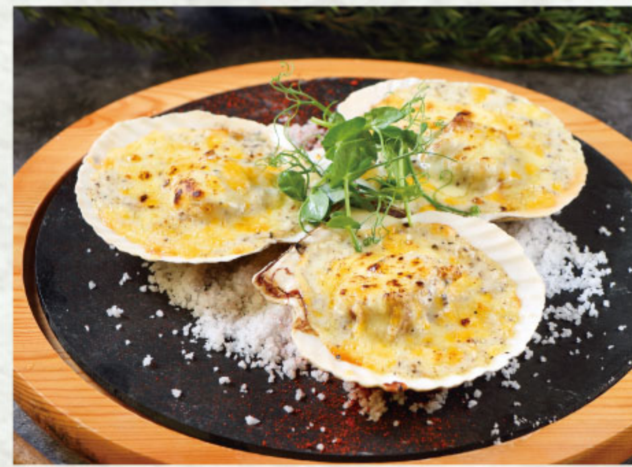
Baked Scallops with Truffle Cream and Cheese 3pcs $128 黑松露芝士忌廉焗扇貝 (3件)