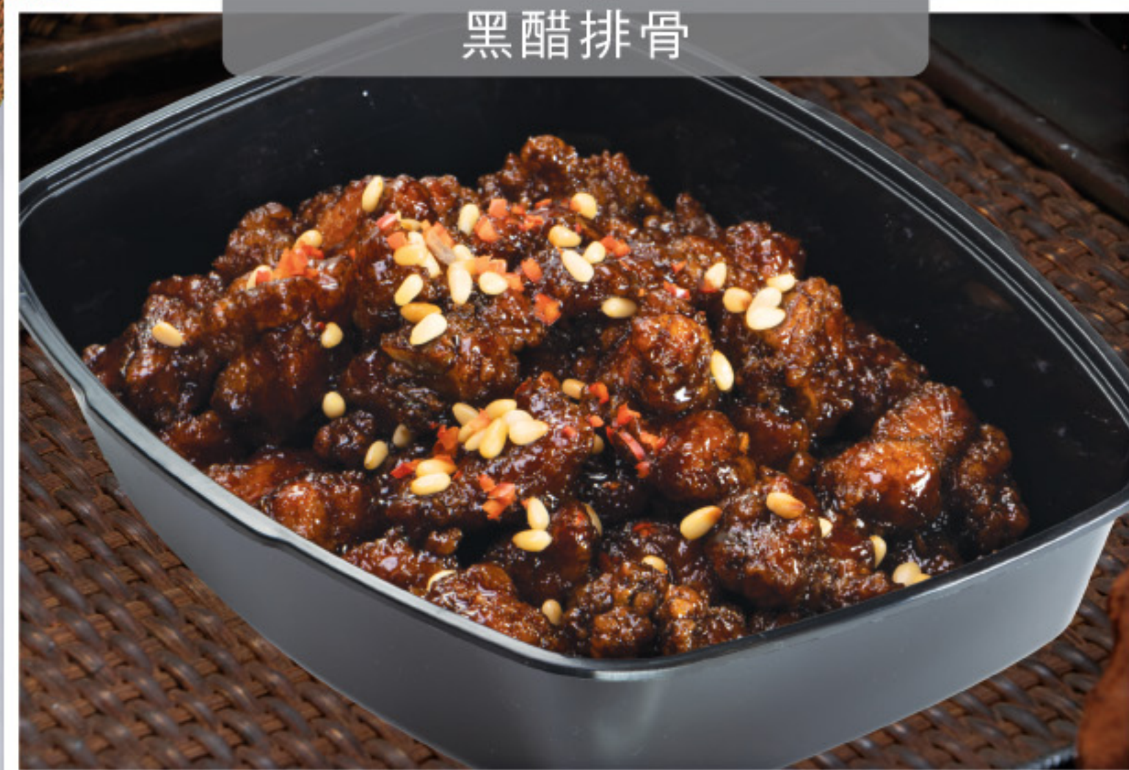
Marinated Ribs with Black Vinegar Sauce 黑醋排骨