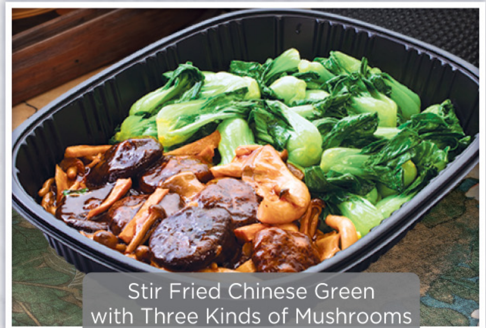
Stir Fried Chinese Green with Three Kinds of Mushrooms 菜苗炒三菇