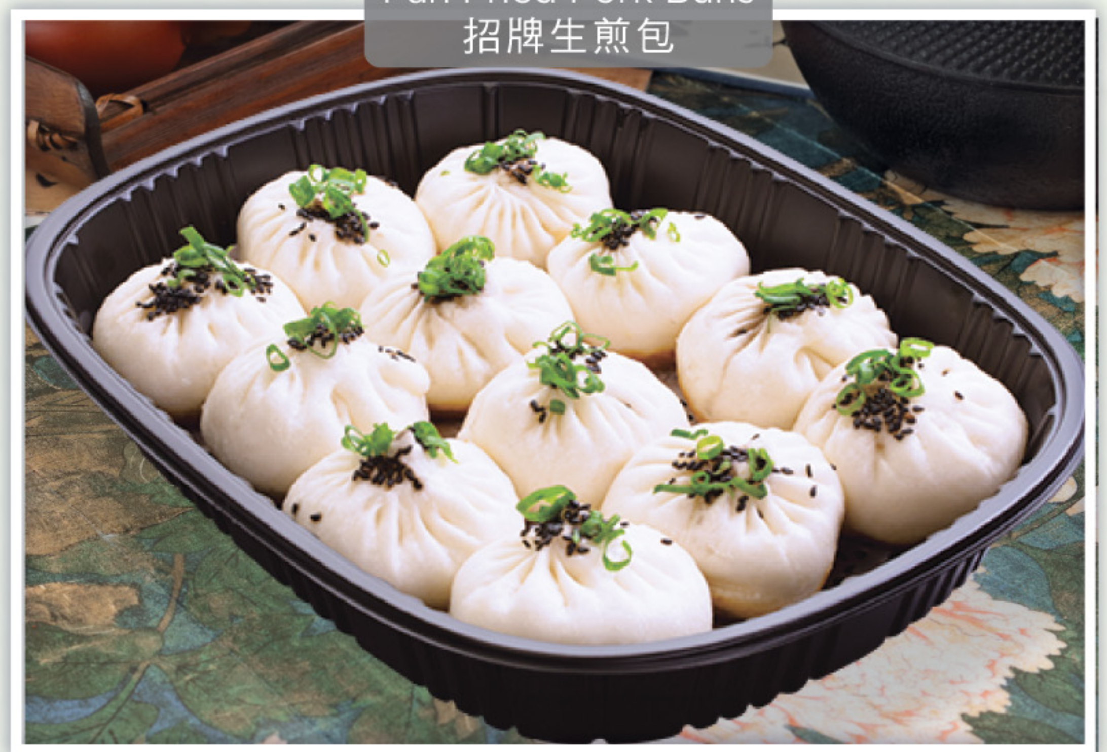
Pan Fried Pork Buns 招牌生煎包