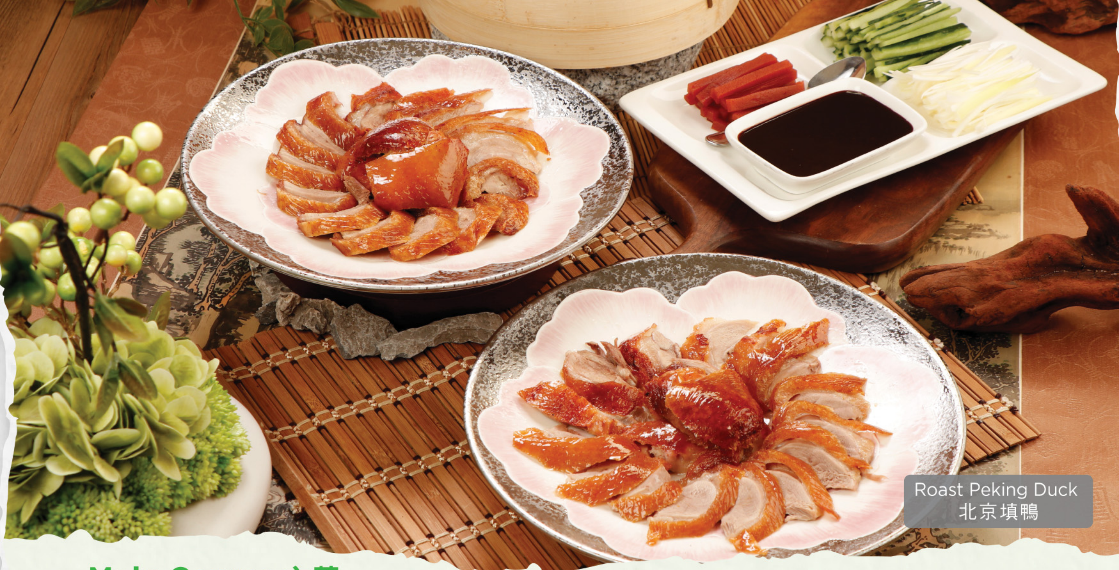
Roast Peking Duck 北京填鴨