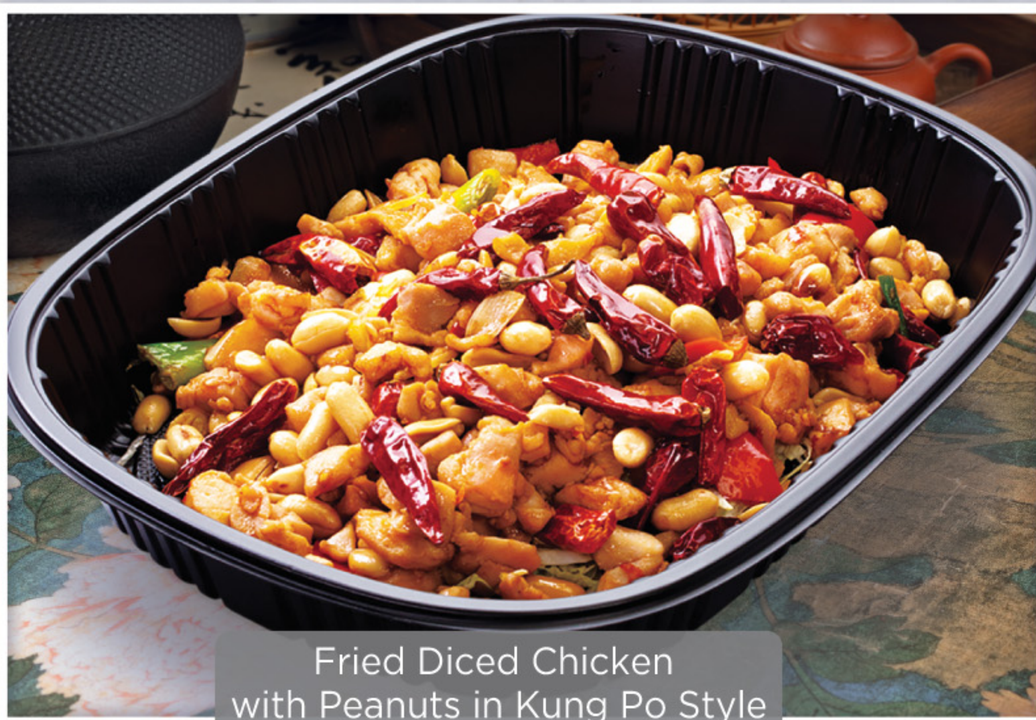
Fried Diced Chicken with Peanuts in Kung Po Style 宮保雞丁