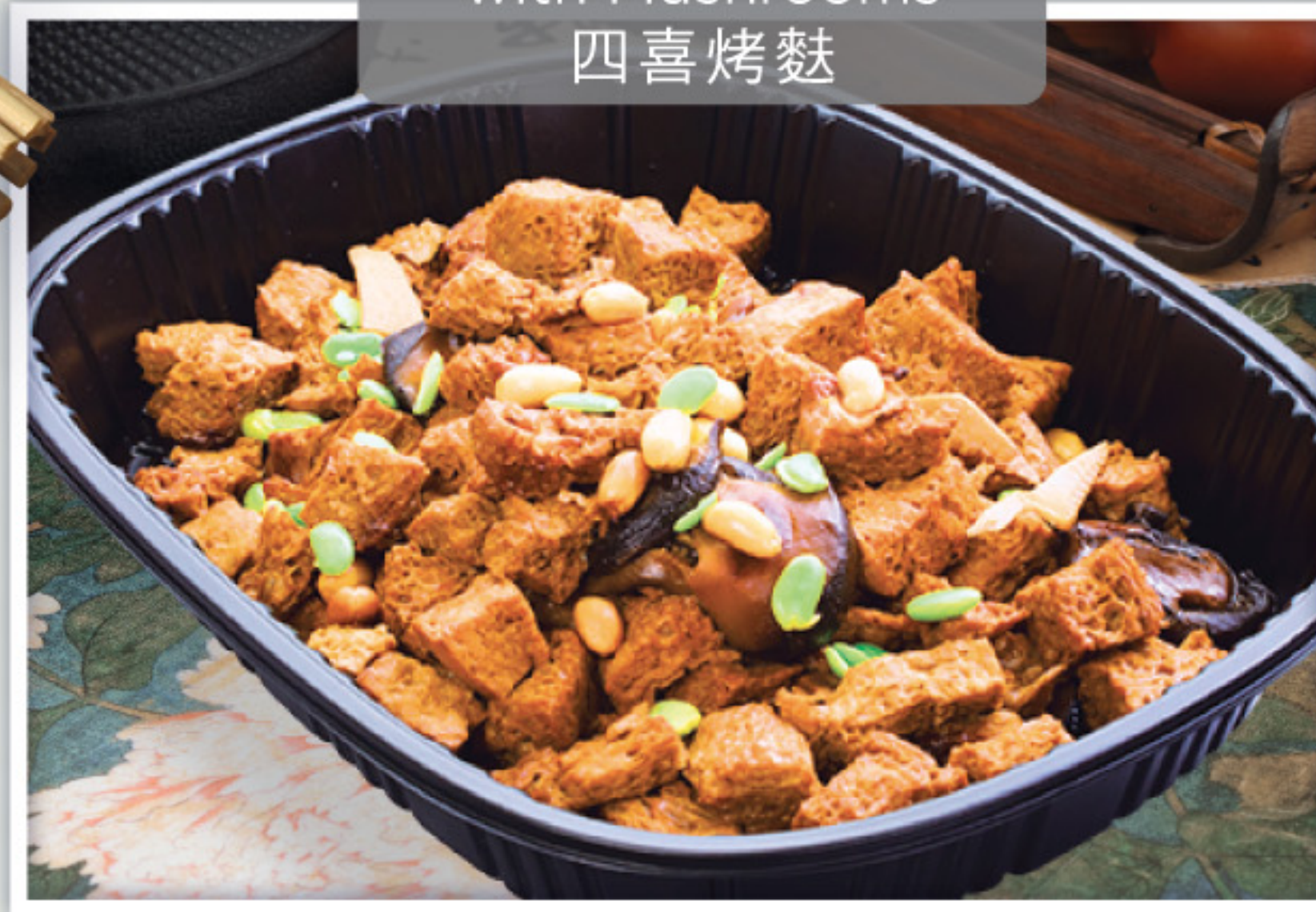
Braised Wheat Gluten with Mushrooms 四喜烤麩