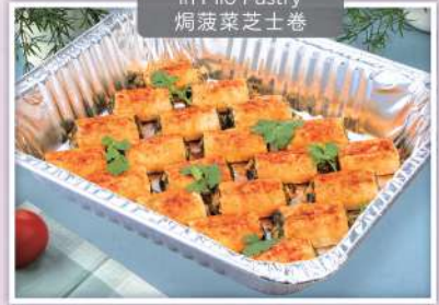
Spinach and Cheese in Filo Pastry 焗菠菜芝士卷