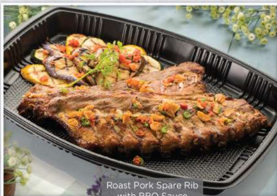
Roast Pork Spare Rib with BBQ Sauce 燒豬肋骨配燒烤汁