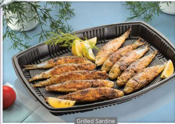
Grilled Sardine 扒沙丁魚