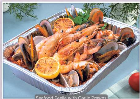
Seafood Paella with Garlic Prawns 西班牙海鮮焗飯配蒜片蝦