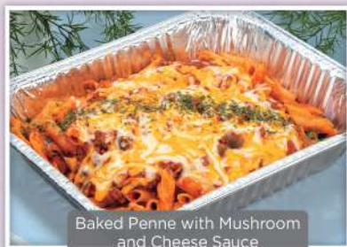
Baked Penne with Mushroom and Cheese Sauce 焗磨菇芝士長通粉