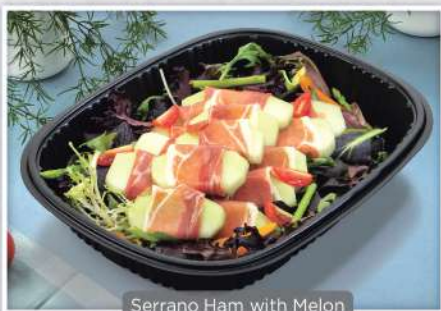
Serrano Ham with Melon 西班牙風腿伴哈蜜瓜