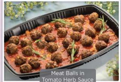
Meat Balls in Tomato Herb Sauce 蕃茄香草肉丸