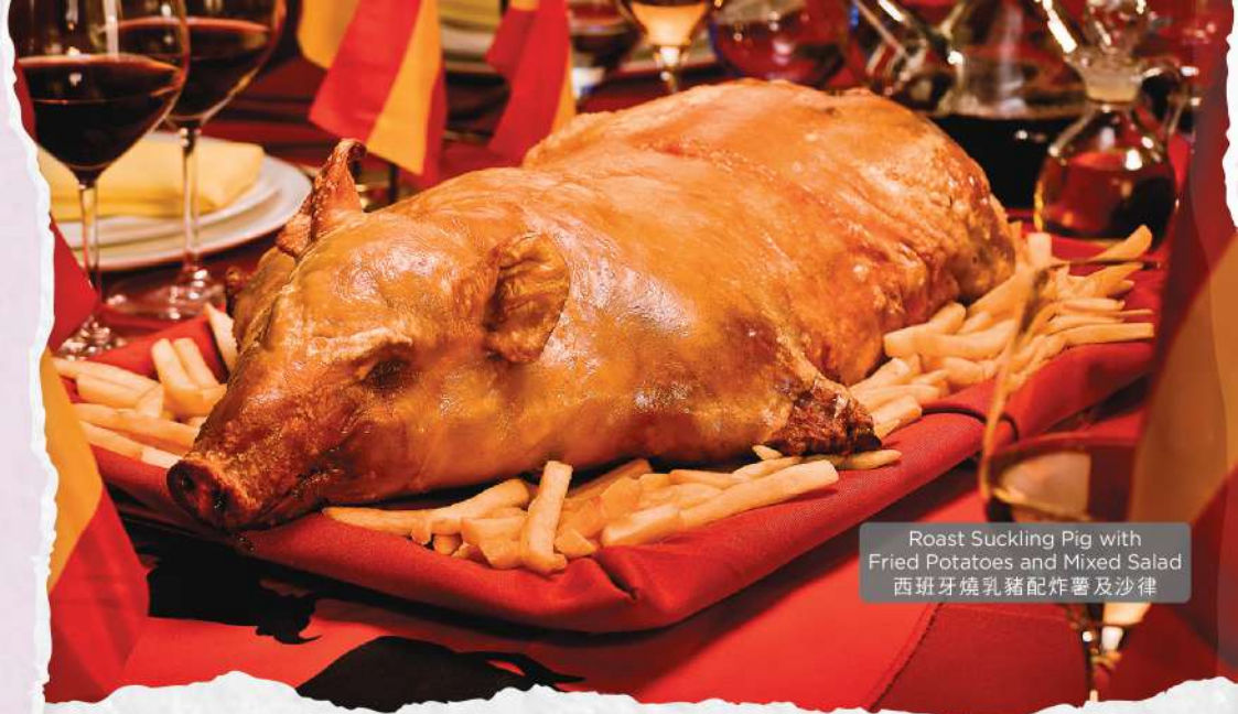
Roast Suckling Pig with Fried Potatoes and Mixed Salad 西班牙燒乳豬配炸薯及沙律