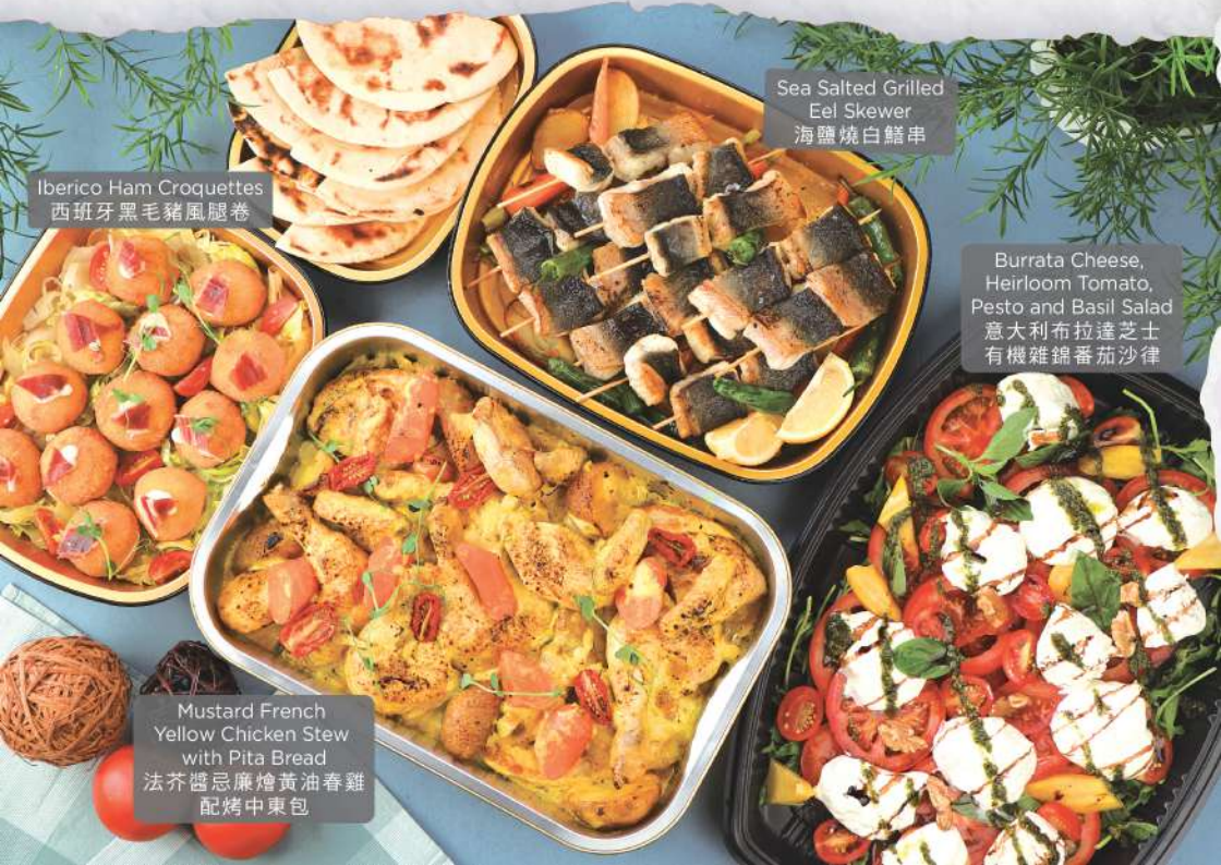
Iberico Ham Croquettes 西班牙黑毛豬風腿卷